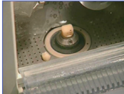
CAD/CAM milling machine