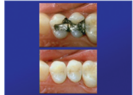
Results in one appointment