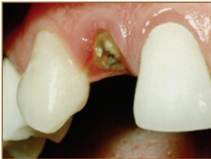
Tooth that must be removed