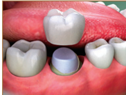
Root canal therapy and crown